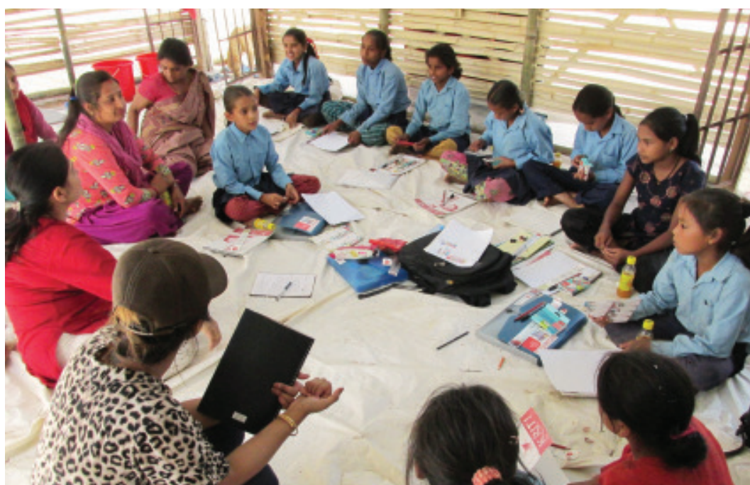
A group of girls share their vision for the future during a consultation with children.

More details of the methodology and a summary of strengths and limitations of the consultation can be found in Annex I.