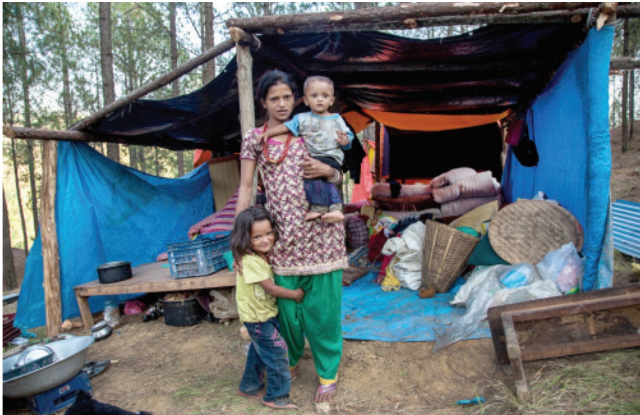
Many children continue to live in temporary shelters after the earthquake destroyed their homes.