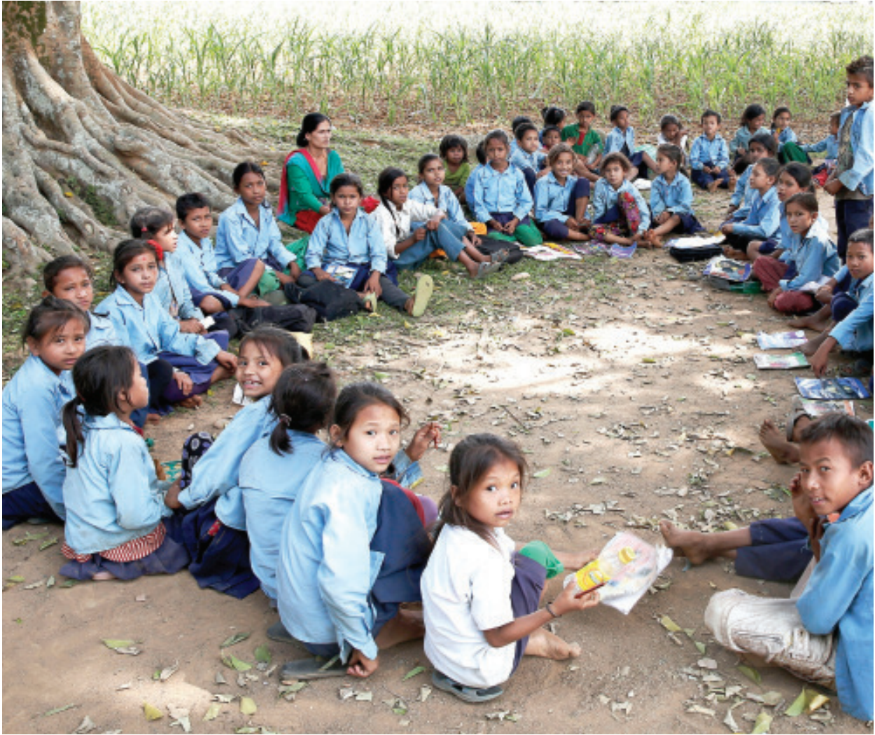
Classes are held under the shade of two trees in Dhading, one of the earthquake-affected districts in Nepal. Following structural assessment post-earthquake, parts of the school compound have been marked unsafe for immediate use without repairing.