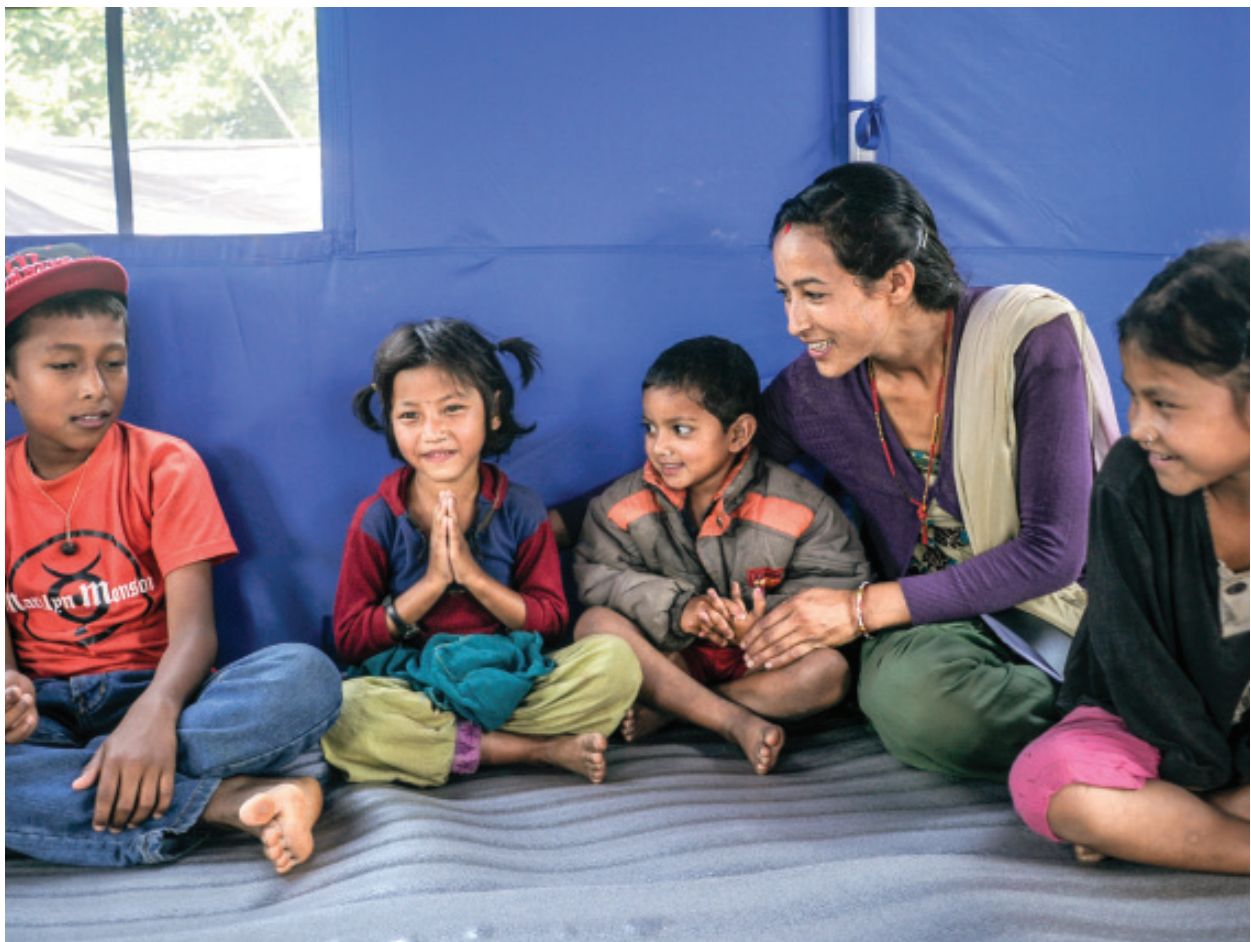
Children attend one of the first Child Friendly Safe Spaces to open in Gorkha

"Parents used to scold and scare us when we played near them, but now they want us to stay in their sight and are very caring." – boy aged 8-12, Rasuwa