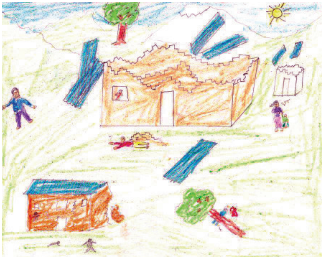
A child's drawing showing destruction in his village caused by the earthquake

While shelter, education, health and hygiene emerged as priority concerns for children, broader impacts of the earthquakes were also discussed in the H-assessment, expressive drawing and body mapping exercises. Most prominent among the impacts described by children in these exercises were: