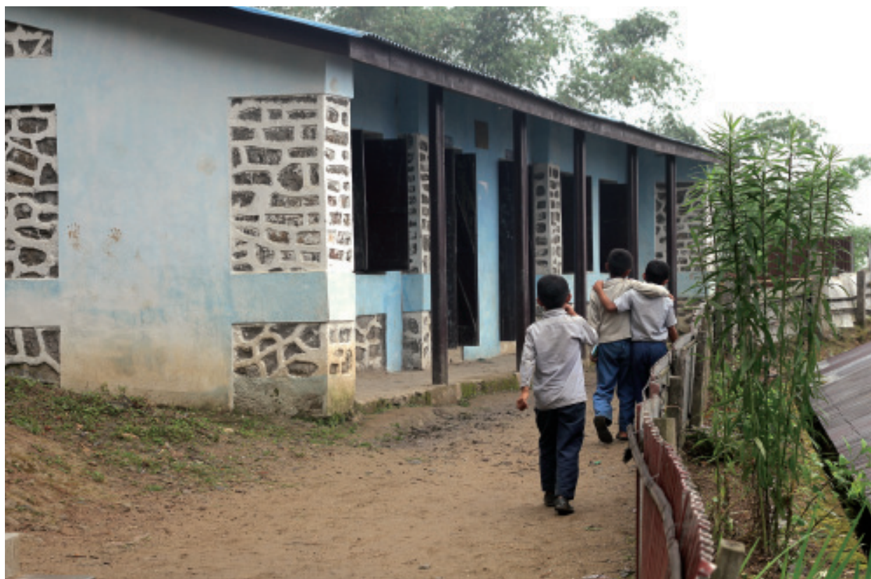
A retrofitted school building in Ilam, rebuilt after the 18 September 2011 Earthquake.