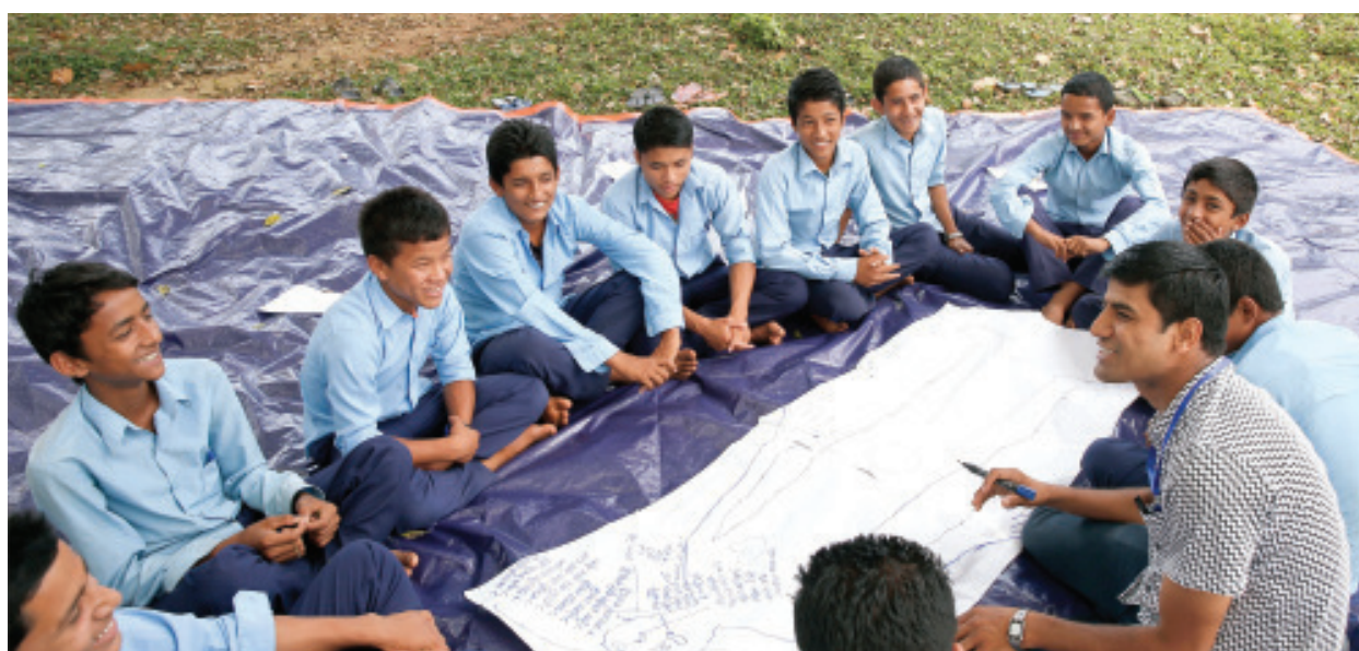
A facilitator leads a group of boys participating in the consultation with children in Dhading.

The visioning tool (using drawings, writing and discussions) was used to seek children's ideas about what they wanted their lives and communities to look like after one year. In the expressive drawing exercise, children were also asked to suggest solutions to the concerns they had identified. This section reflects the outcomes of these two exercises.