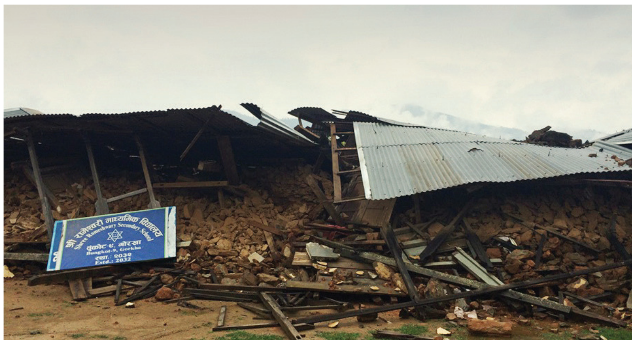
A school in Gorkha completely destroyed by the April 25th earthquake.