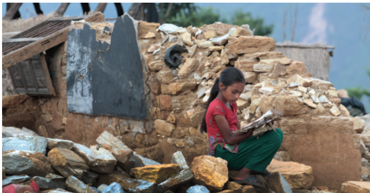
A young girl reads a book that she found among the rubble of destroyed school in Gorkha

Among the children who expressed dissatisfaction, over half said they thought relief items had been distributed unfairly and that those with political connections were able to access relief more quickly and easily. Others said that they or others from more marginalized or remote communities had difficulty in accessing relief and in some cases had received no assistance.