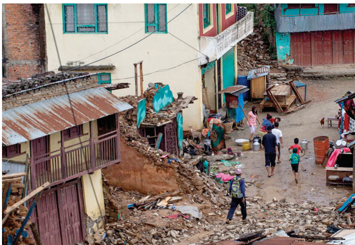
Houses destroyed during the April 25 earthquake at Rupinala village, Masel VDC in Gorkha