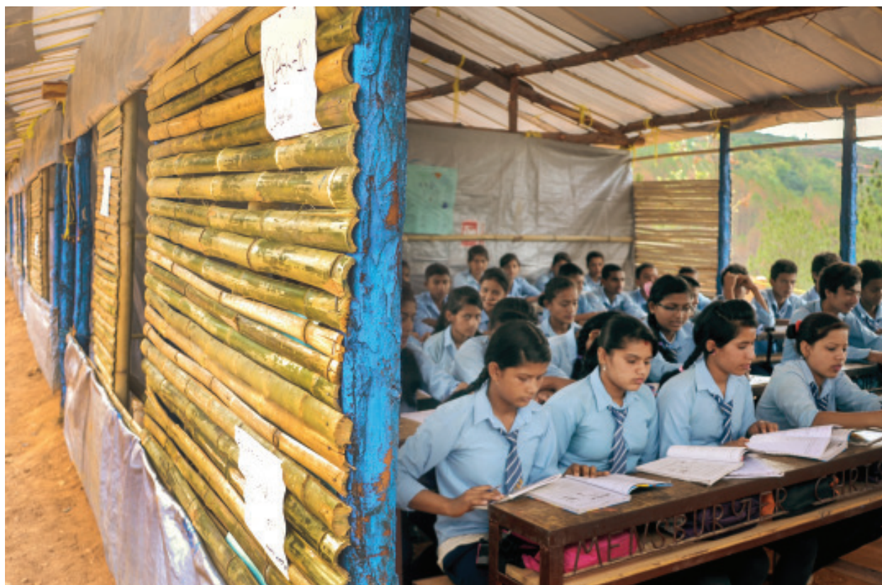
Classes are running in temporary learning space at a school in Sindhupalchowk.