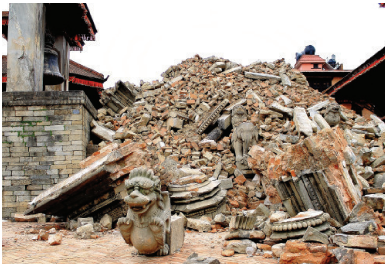
The earthquake destroyed numerous heritage sites, including Vatsala temple, Fasidega and other cultural sites in Bhaktapur.

Children in 67 FGDs referred specifically to feelings of sadness and insecurity as a result of the destruction of cultural heritage sites including temples and other places of worship, as well as monuments and historic buildings. Temples, stupas and monasteries have both a spiritual and social significance and would have been visited by many children on a daily basis on their way to school, at festivals and on other occasions. Moreover, during a crisis such as that being experienced in Nepal, children and their families would normally have gone to temples or other places of worship to pray for better times.