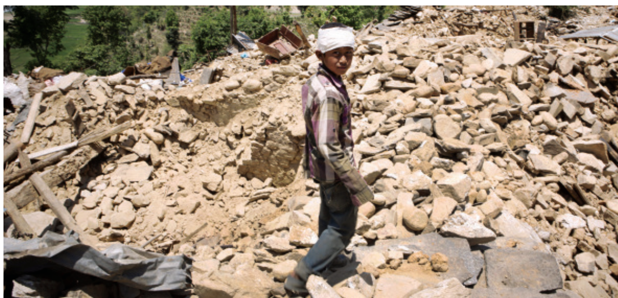
A boy shows his home destroyed by the earthquake.